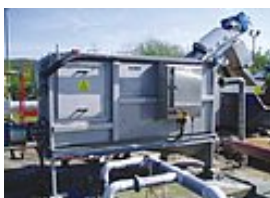
ROTAMAT® Sludge Acceptance Plant Ro3