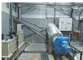
ROTAMAT® Screw Press RoS 3Q on distillery AD plant