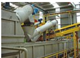
ROTAMAT® Complete Plant Ro 5 for screening and grit removal