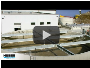
Video: HUBER Disc Thickener S-DISC for thickening of excess sludge in meat processing industry https://www.youtube.com/watch?v=HvwV0BaLd68