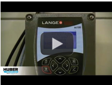
Video: HUBER Disc Thickener S-DISC - here at a municipal WWTP https://www.youtube.com/watch?v=3B0yOFFdLyo