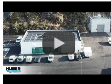
Video: Complete wastewater treatment at the Øygarden WWTP in Norway https://www.youtube.com/watch?v=KU2awn3DP68