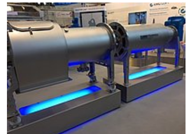
HUBER Sludgecleaner STRAINPRESS®