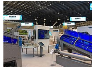
HUBER Screw Press Q-PRESS®