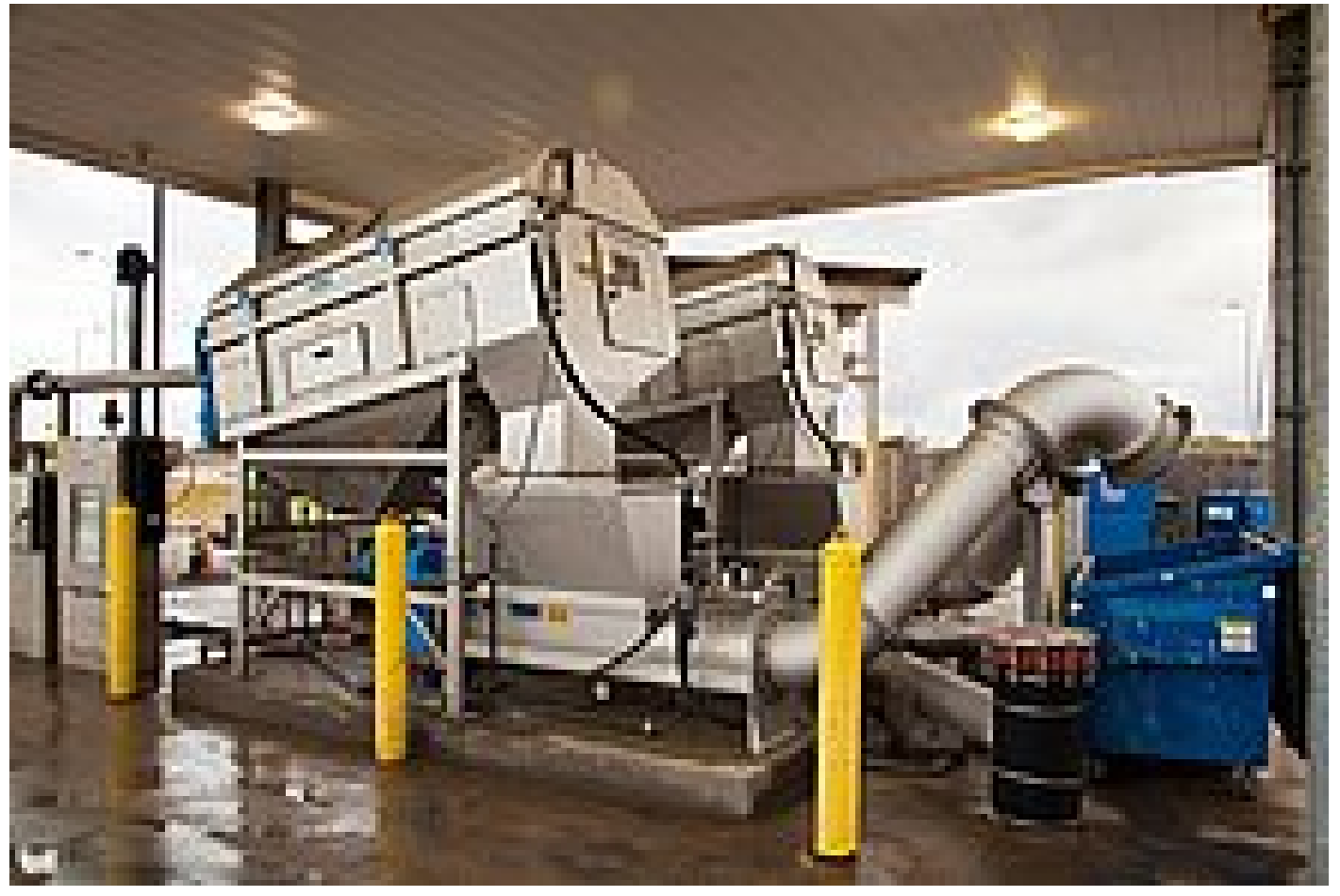
HUBER Sludge Treatment products in the San Antonio receiving station process

The San Antonio Water System had been making a homemade screen system work. It wasn't perfect – but it only seemed to fall short in keeping grit from entering their system.