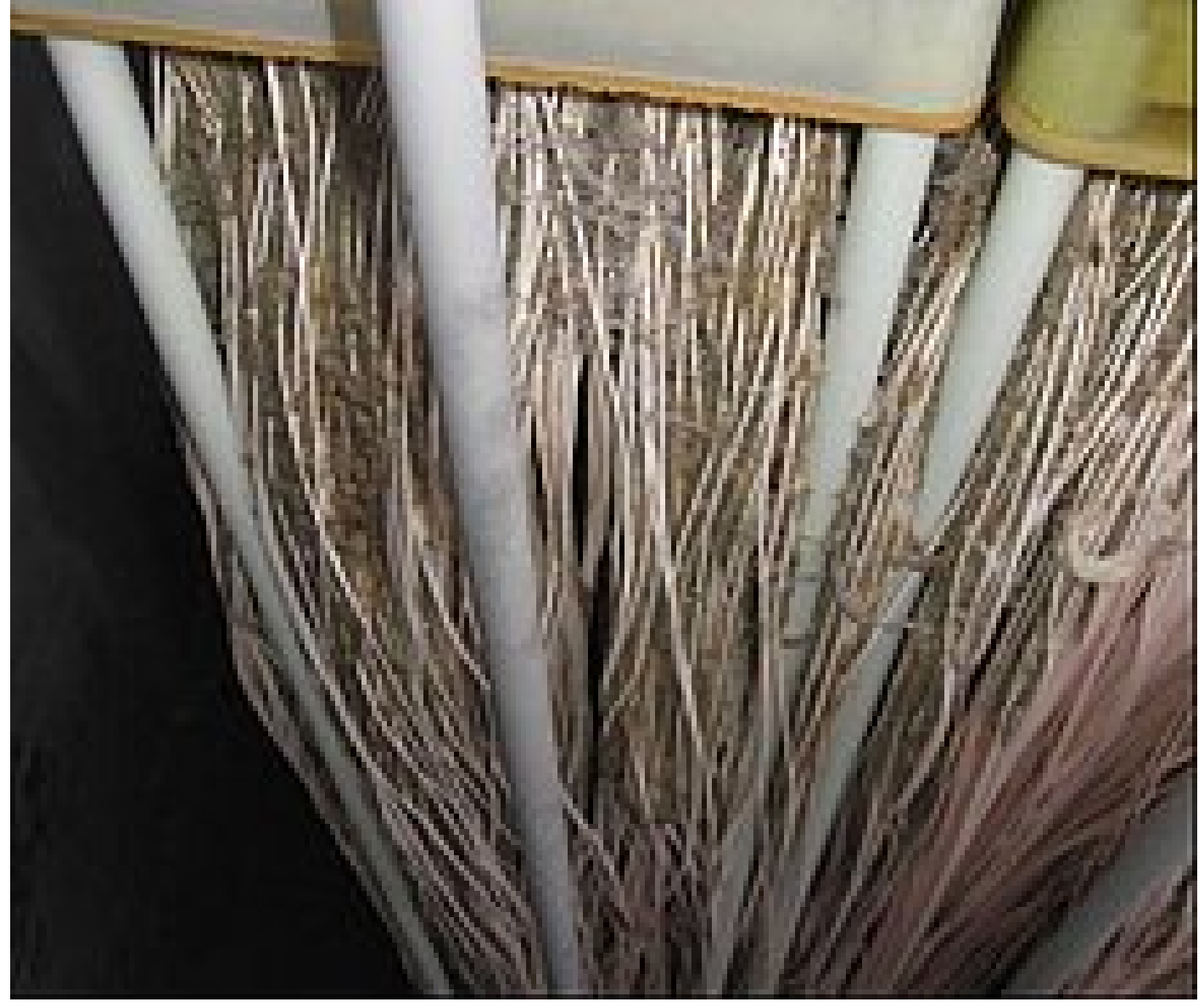
Insufficient pre-treatment of wastewater leads to clogging of fibre membranes

In Las Vegas, Nevada the two American contractors CH2M Hill and Greely Hanson build the biggest membrane sewage treatment plant of North America.