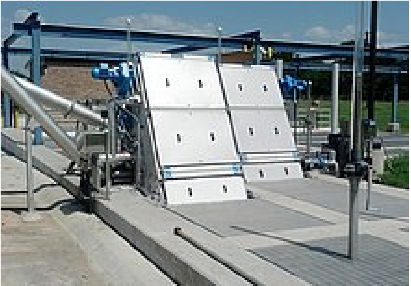
HUBER's Belt Screen EscaMax® improves reliability and process efficiency at Greenville's WWTP

The City of Greenville's Wastewater Reclamation Center had been operating in a "vintage 1953" facility and – despite a couple of upgrades – it was still behind peer facilities in the modernization of its equipment and processes.