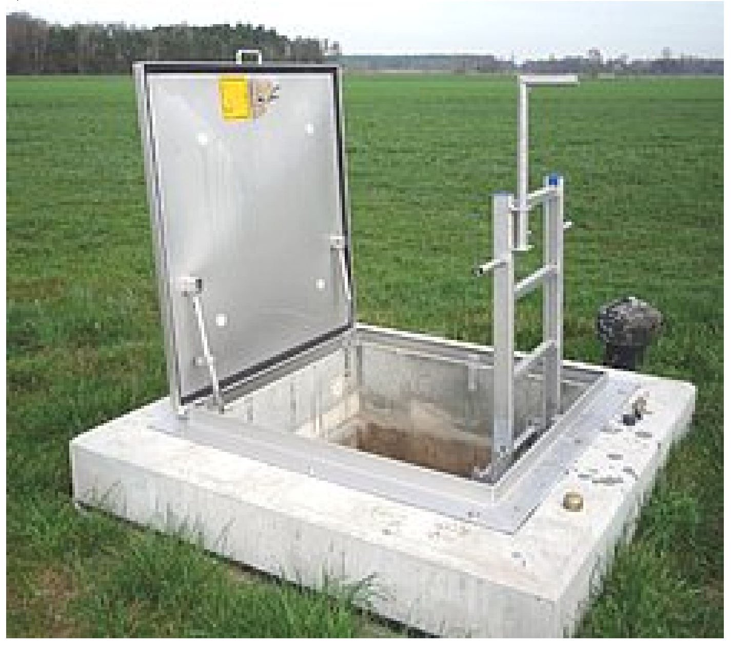
Safe equipment: manhole covers, safety access ladder and entrance aid