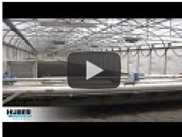
Video: Solar Active Dryer SRT at STP Marktbergl https://www.youtube.com/watch?v=Zajln8OGxpk