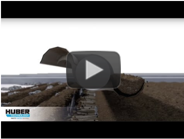
Animation: HUBER Sludge Turner SOLSTICE® for large quantities of sludge https://www.youtube.com/watch?v=T-FUbjSzMZE