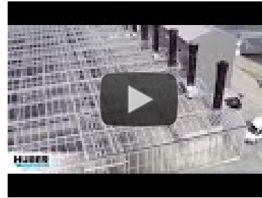
Video: HUBER Sludge Turner SOLSTICE® https://www.youtube.com/watch?v=QdWhhrCOKug