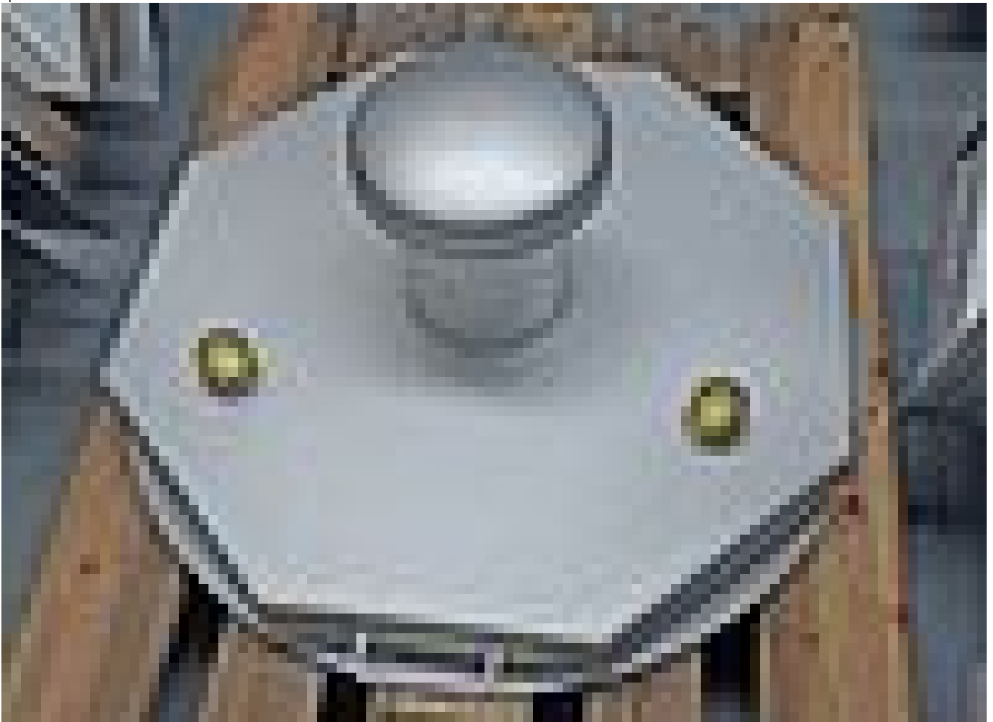
Watertight manhole cover SD5, rectangular type