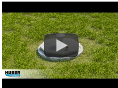
Animation: HUBER manhole covers https://www.youtube.com/watch?v=5yRY0imEBIM