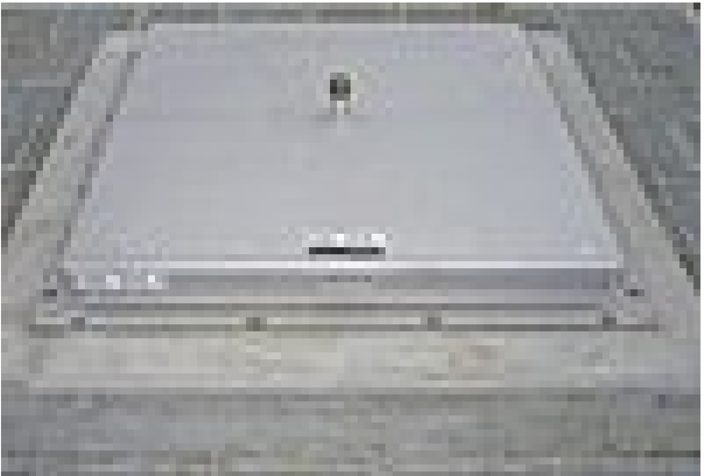
Manhole cover, watertight up to 1 m head of water, rectangular in shape, completely made of 1.4307 (AISI 304 L) stainless steel.