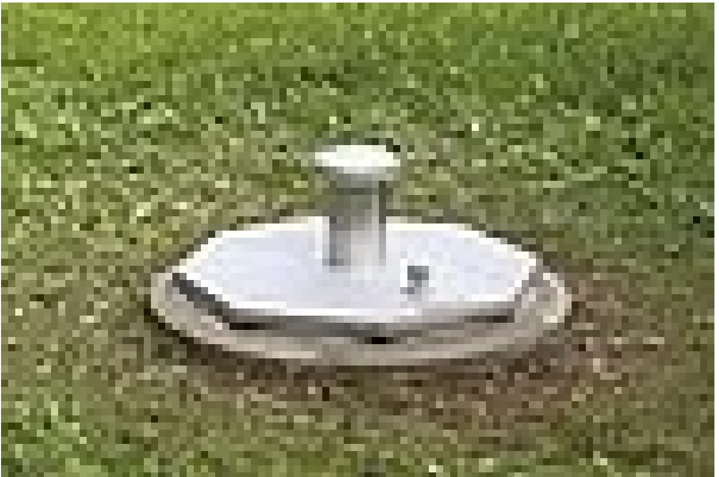
Manhole cover, weatherproof, round in shape, completely made of 1.4307 (AISI 304 L) stainless steel.