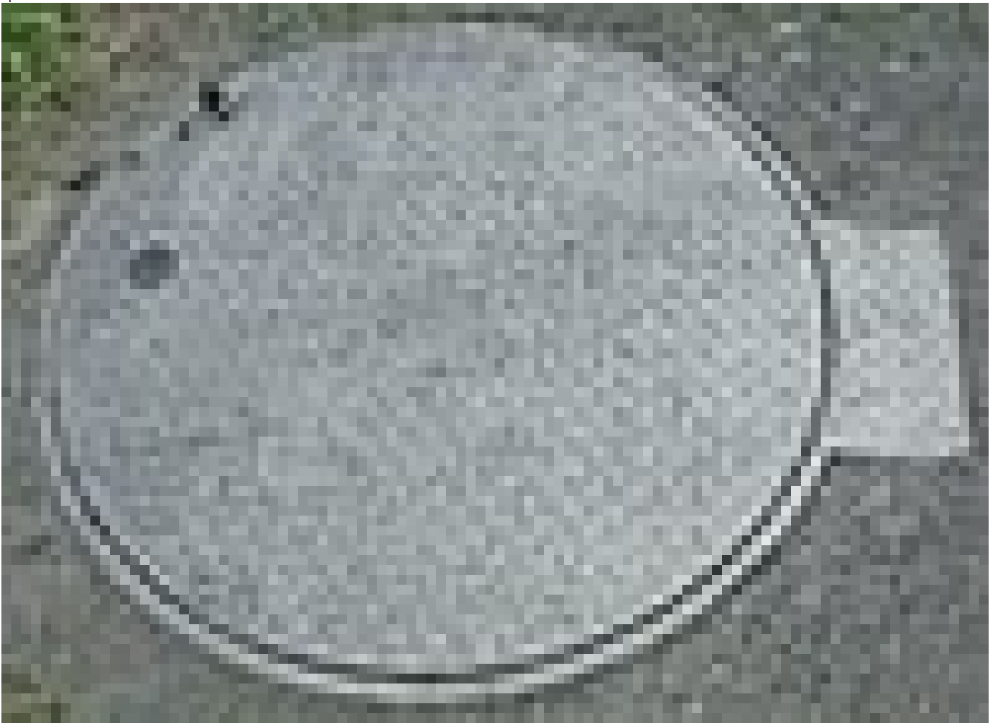
Sliding hatch cover SD12