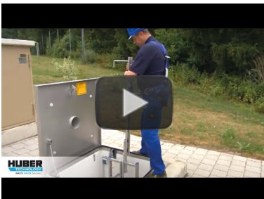
HUBER manhole equipment: production & in operation https://www.youtube.com/watch?v=eOOBIZwQQ_Y