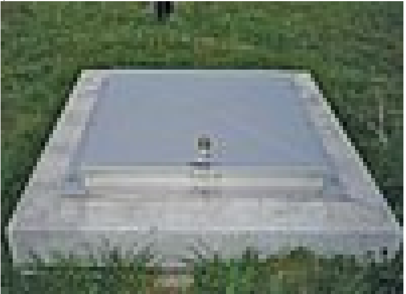
Weatherproof manhole cover SD2, round type