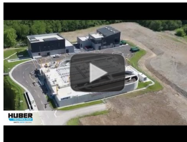
Video: HUBER Belt Dryer BT for high efficiency sewage sludge drying https://www.youtube.com/watch?v=PN7G-vk_r3c