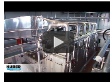
Video: HUBER Belt Dryer BT for medium temperature sewage sludge drying https://www.youtube.com/watch?v=7DzeODjrGXg