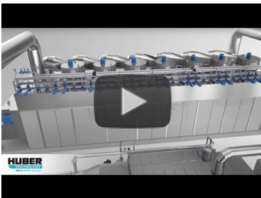
Sewage Sludge Drying with HUBER Belt Dryer BT https://www.youtube.com/watch?v=6VTJ1ex10bQ