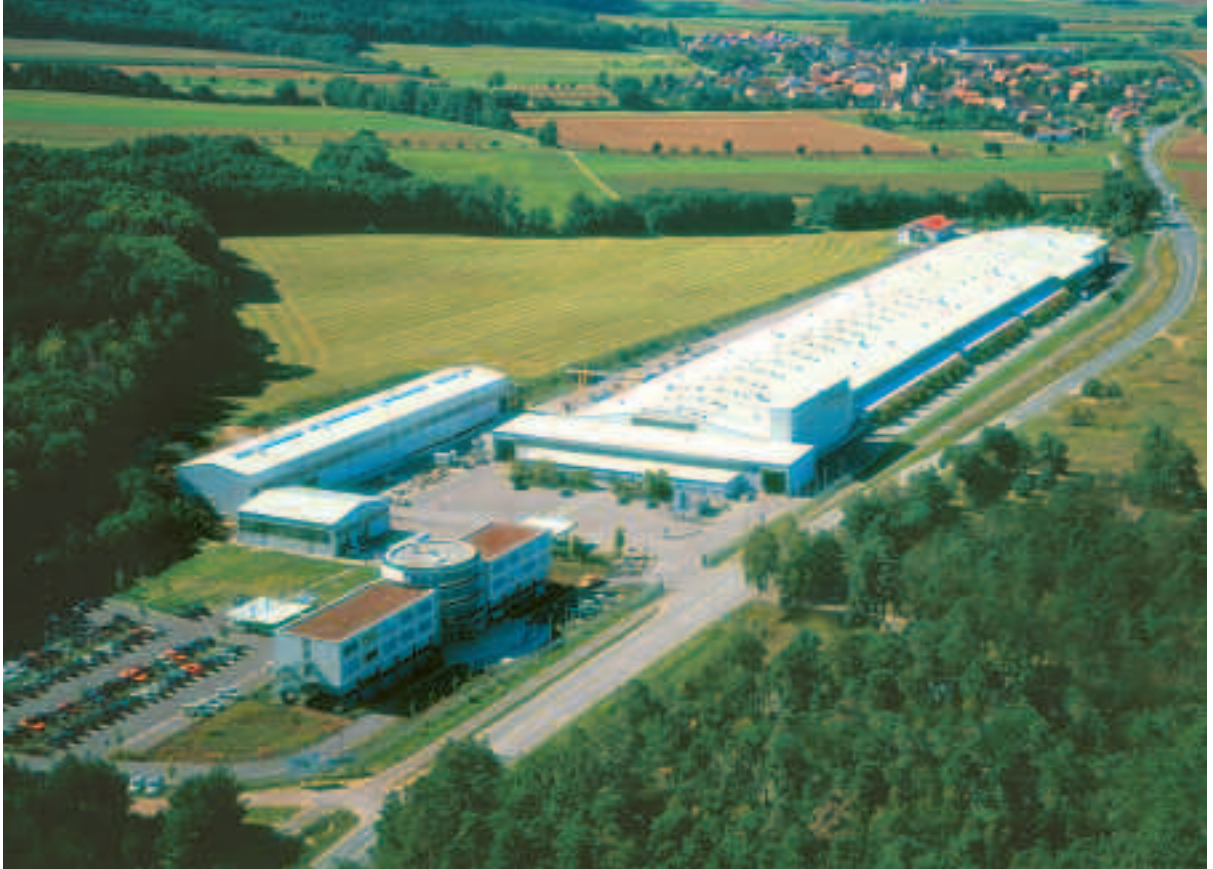
The HUBER factory at Berching, Bavaria