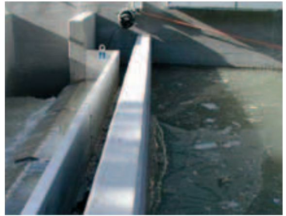
Unused storage capacity in a storage structure

Stormwater overflows within combined sewer systems typically have a fixed weir. When the critical rainfall intensity is exceeded they overflow at a defined water level height and discharge into a receiving watercourse. Fixed weirs, however, have the disadvantage in that the water is already being discharged before the maximum permissible water level is reached with the consequence that the actual storage capacity of the inlet structure remains unused. Frequently this results in new structures having to be built or existing structures extended which ultimately involves high civil costs. Additionally, without screens considerable amounts of floating and coarse material will be discharged into the receiving watercourse which results in water pollution and furthermore backwater caused by flooding may affect the sewer system and ultimately reduce its efficiency.