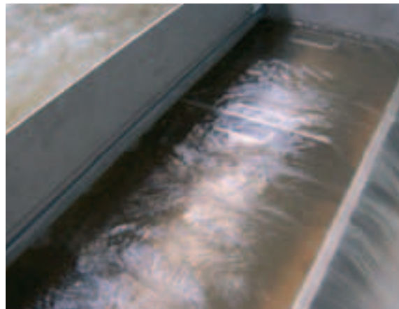
ROTAMAT® Storm Screen RoK2 with integrated gauging weir during overflow discharge

The HUBER system solutions combine a HUBER screen with a gauging weir and thus provides an option for removal of the floating and coarse material from the combined overflow including accurate measurement by means of a gauging weir and fully automatic measuring and evaluation equipment. The operator is therefore able to monitor the operating behaviour and identify unfavourable conditions (such as backwater, influence of floodwater, etc.). Additionally, the calculated discharge volumes expected can be routinely compared with the actual obtained measuring data to enable further optimisation of the entire sewer network control and ultimately reduction of the discharge volumes.