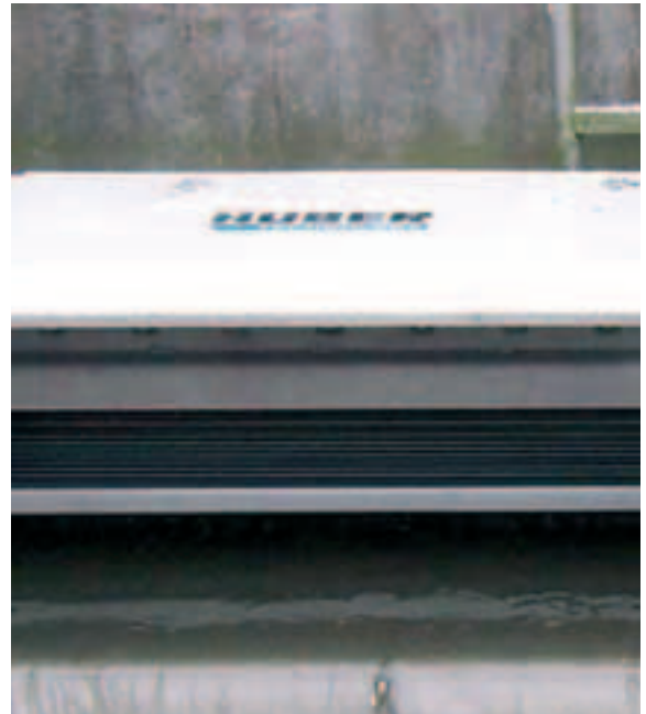
HUBER High Performance Flow Screen HSW with innovative screening chamber and integrated gauging weir during overflow discharge

The optimally suitable system solution is individually assessed and selected for each project in order to specifically meet the requirements for local hydraulic and constructional conditions within the overflow discharge structures.