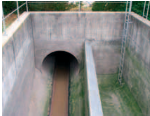
Separating structure without a screen and discharge measuring equipment

In the event of heavy rainfalls large amounts of combined water may pass into the receiving water course via overflow discharge structures or stormwater overflow tanks. Frequently, there is no screening plant installed with the consequence that the discharged water contains floating and coarse material. Such material is not only a heavy burden for the receiving water courses but also unsightly and will result in significant cleaning and disposal costs. In addition, the discharged overflow is frequently not measured and with the omission of measuring equipment will mean a significant loss of critical information relating to the operating behaviour of the storage and overflow structure.