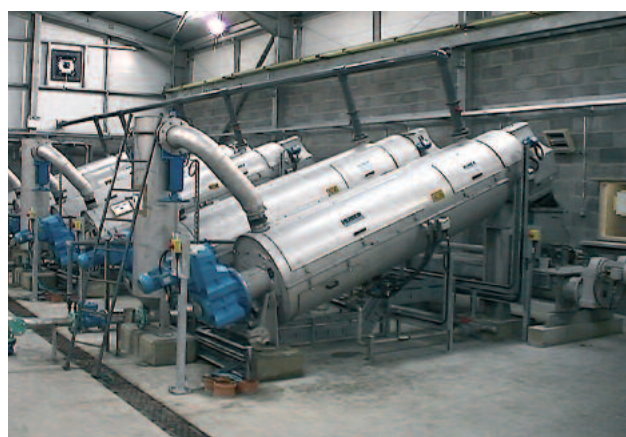
Parallel installation of several ROTAMAT® Screw Press RoS3 units