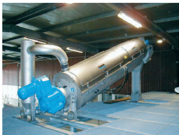
ROTAMAT® Screw Press RoS 3 for 8 m 3 /h