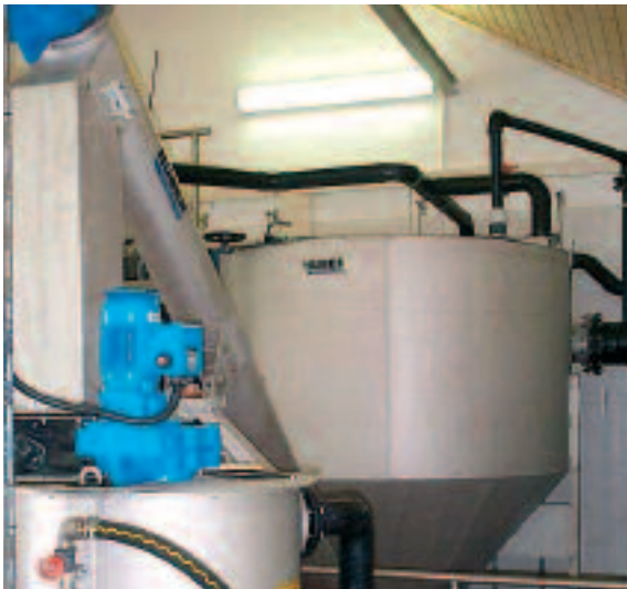
HUBER Circular Grit Trap HRSF with integrated classifying screw and subsequent grit washer

The layout of the HUBER Circular Grit Trap HRSF was made on the basis of numeric design engineering and tested and verified under practical conditions in collaboration with the German test institute LGA.