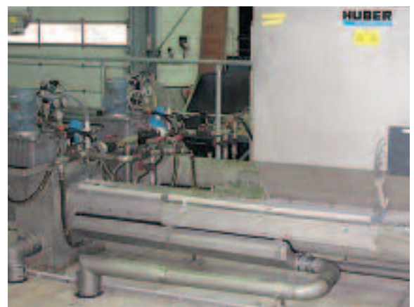
The hydraulic high-pressure unit guarantees a maximum DR.