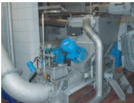
Maximum washing and dewatering results