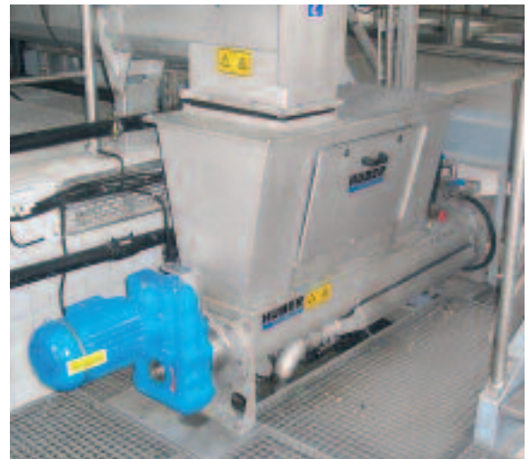
Reliable screenings treatment with the WAP