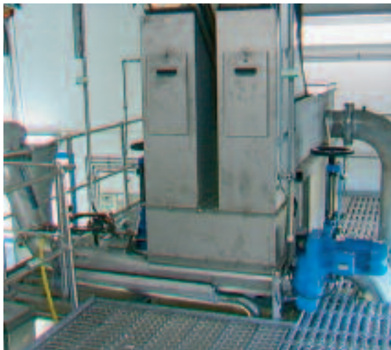
For any discharge requirements