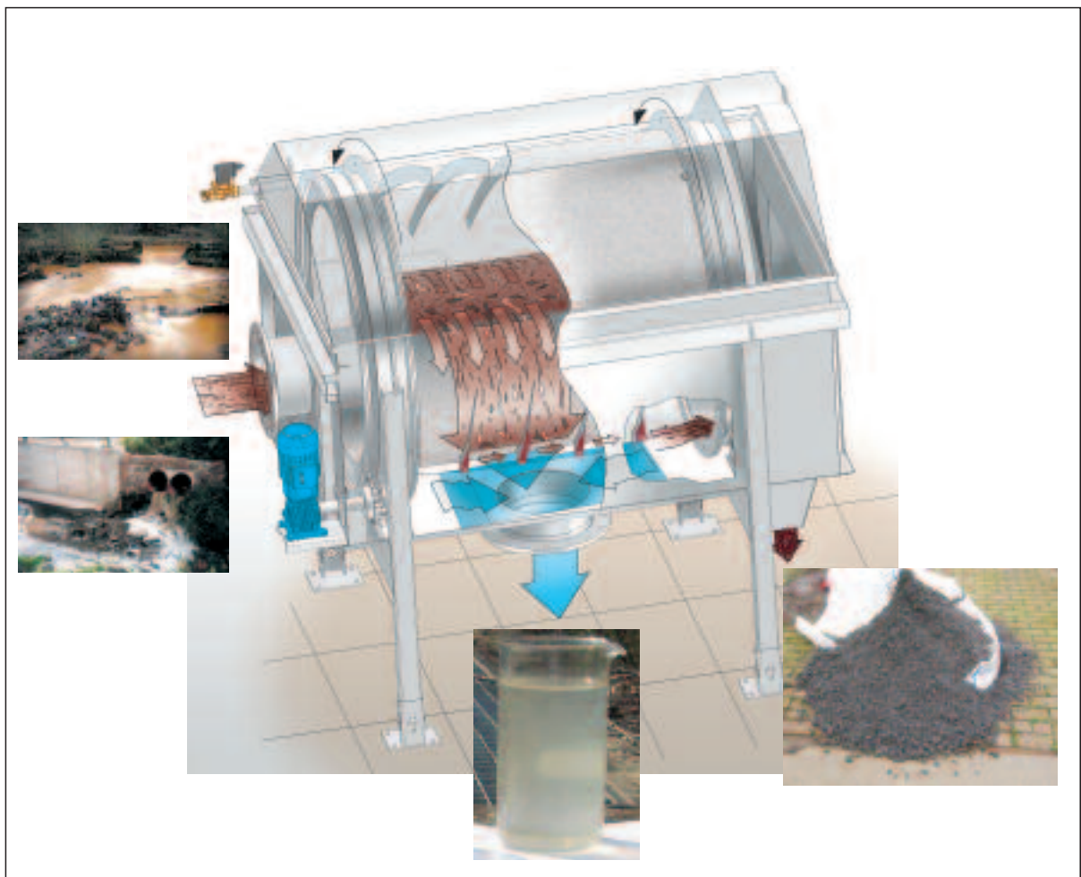
Schematic drawing of the ROTAMAT® Rotary Drum Screen RoMesh®