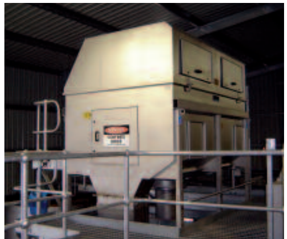
ROTAMAT® Rotary Drum Screen RoMesh® for optimal separation of very fine particles