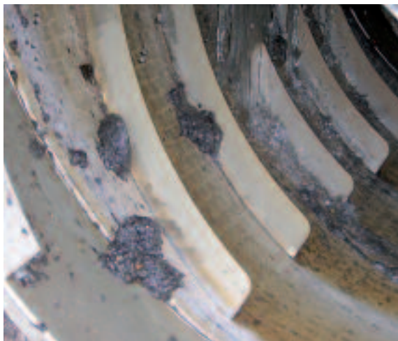
Optimal separation of fibres