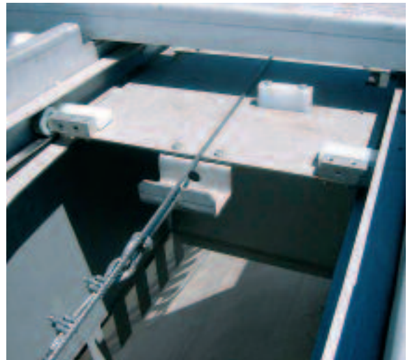
Semi-automatic grease removal by means of a paddle system