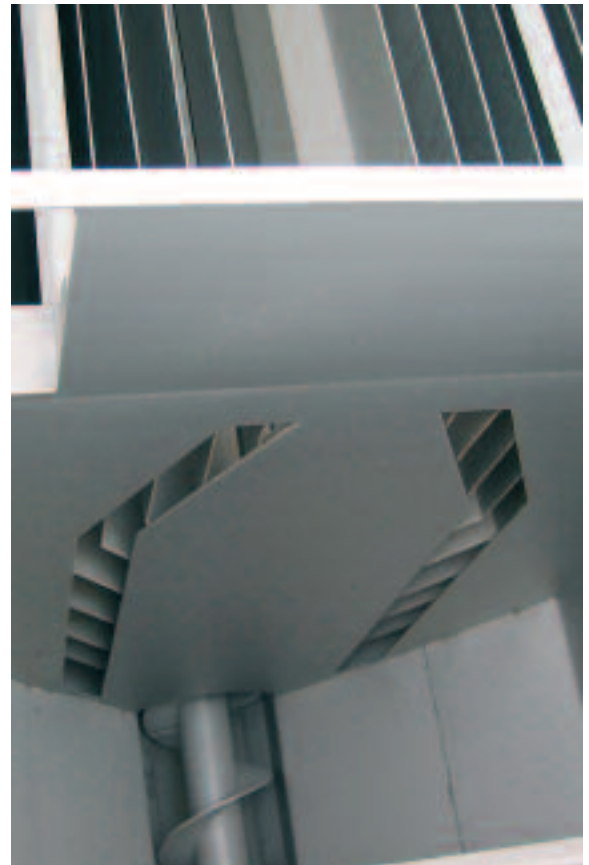
View onto the cross-flow lamella unit