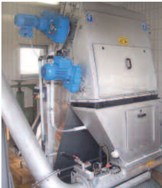
Rear view of the EscaMax® with subsequent Wash Press WAP