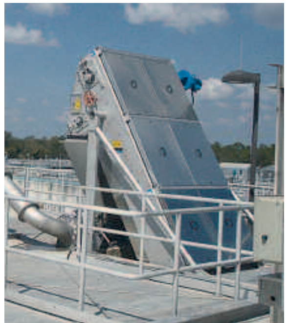
Fully enclosed, odour-free screen with easy to remove covers