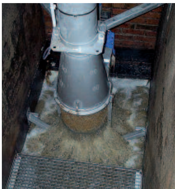
ROTAMAT® Pumping Stations Screen RoK 4 in operation