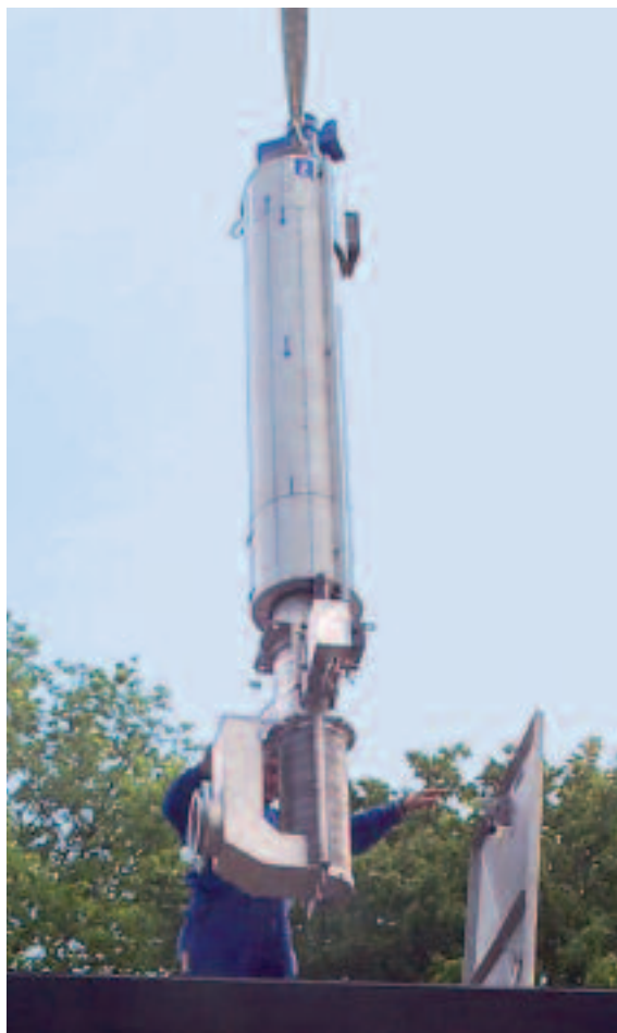
ROTAMAT® Pumping Stations Screen RoK 4 being lifted into a pumping station