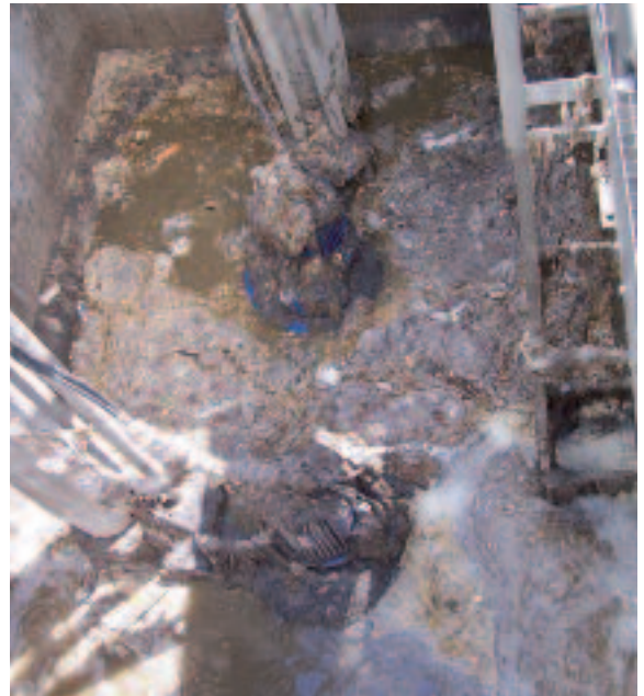
Clogged pumps caused by the solids within the medium to be delivered

The top of the inflow chamber is open and serves as an emergency bypass so that the machine can be submerged without problems, e.g. in case of a power failure. The integrated bottom step prevents back-flooding into the sewer system and thus undesired deposits in the incoming sewer.