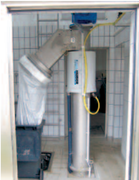
Screenings discharge into a bagger for odour-free disposal