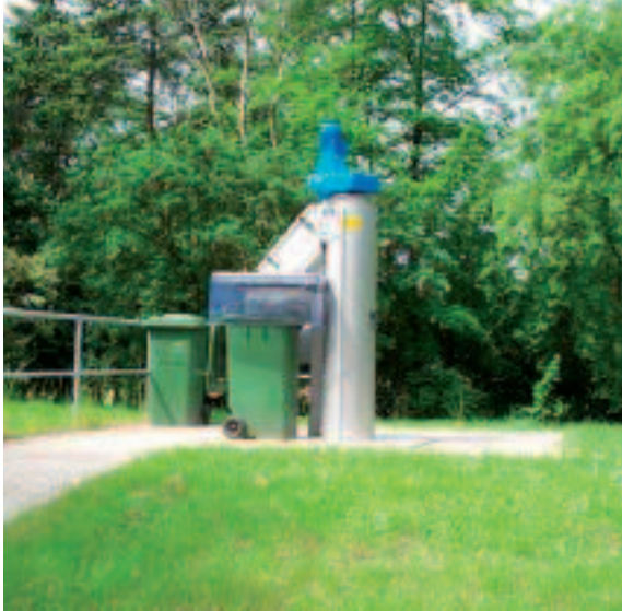
Frost protected outdoor installation

A selection of installation examples will convince you of the ROTAMAT® Pumping Stations Screen RoK 4.