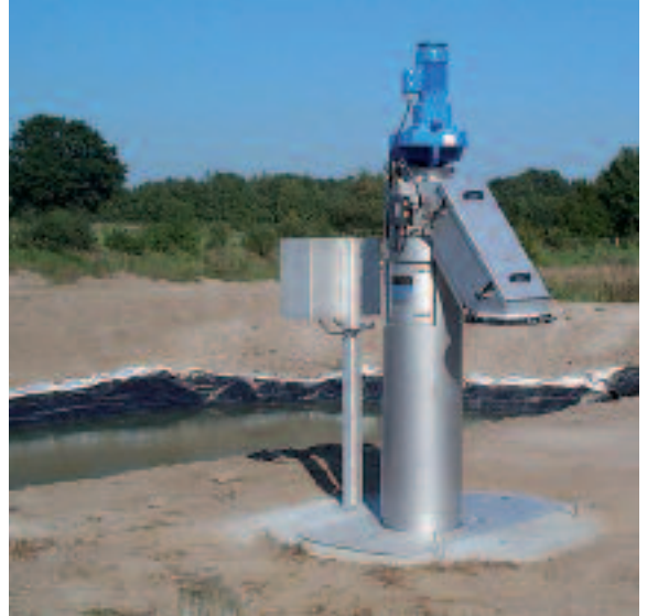
Installation upstream of a pond plant