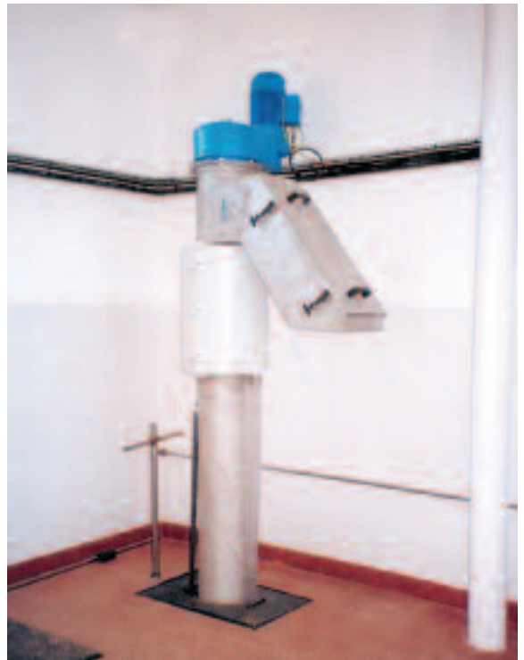
Indoor installation on a small footprint