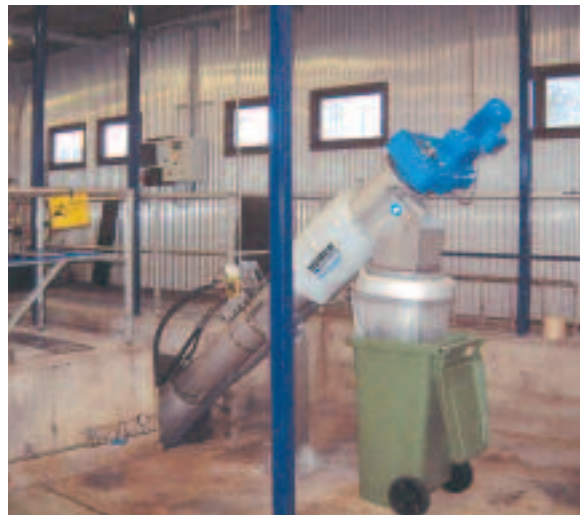
ROTAMAT® Micro Strainer size 700 installed in the channel