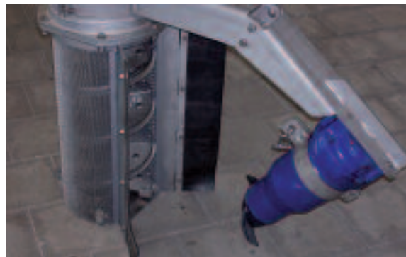
External screenings washing system (ERGA). A preceding washing system washes out the organic matter.