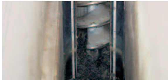
ROTAMAT® Micro Strainer Ro 9 XL with lower maintenance-free ceramic bearing