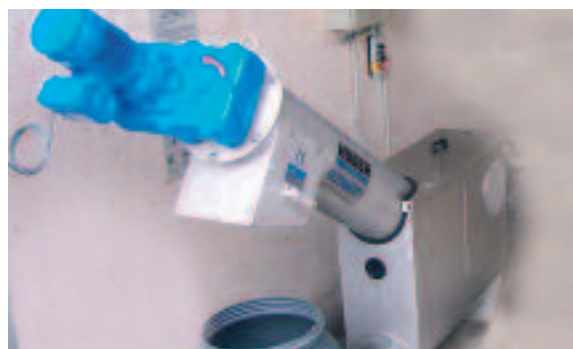
Tank-mounted ROTAMAT® Micro Strainer Ro 9Ec