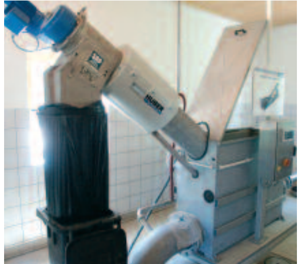
Tank installation of a ROTAMAT® Micro Strainer