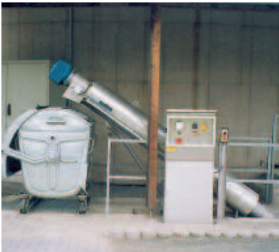
Outdoor installation of a standard ROTAMAT® Micro Strainer