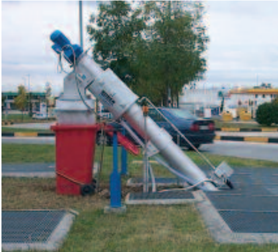
ROTAMAT® Micro Strainer installed in the middle of a roundabout