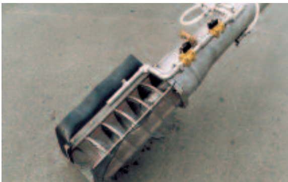
Integrated screenings washing system (IRGA). The ROTAMAT® principle allows for integration of the screenings washing system directly in the lower end of the rising pipe.