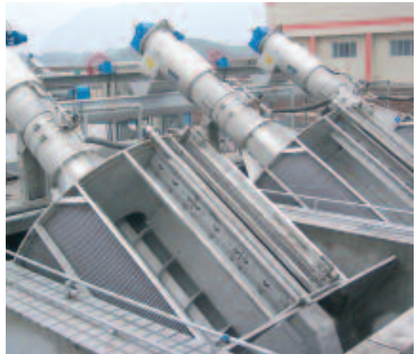
Several parallel ROTAMAT® Fine Screens installed in the channel