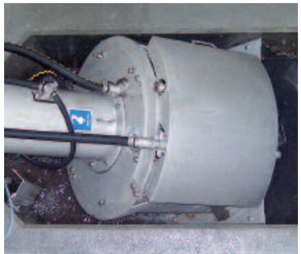
ROTAMAT® Fine Screen with splash guard