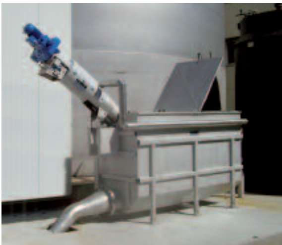
ROTAMAT® Fine Screen Ro 1 in a tank