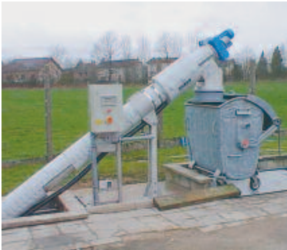
Outdoor installation of a ROTAMAT® Fine Screen Ro 1 with frost-protection