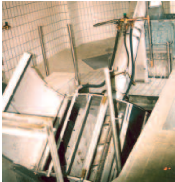
ROTAMAT® Fine Screen Ro 1 with Integrated Screenings Washing System IRGA installed in the channel